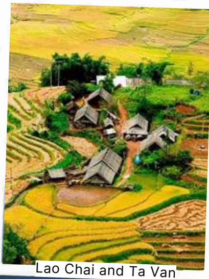
Lao Chai and Ta Van

Free herbal foot massage in 45 minutes ( 15 minutes : herbal foot bath with tea break , 30 minutes : massage , fruits serving)